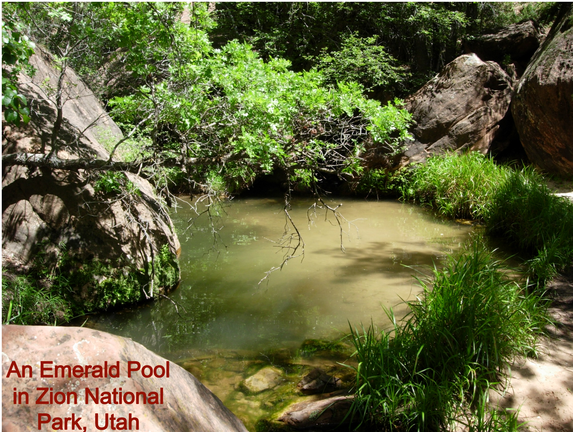
An Emerald Pool in Zion National Park, Utah